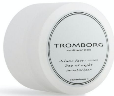
Deluxe Face Cream Day & Night Moisturiser Tromborg