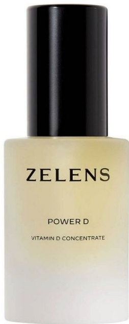
Power D Fortifying and Restoring Serum Zelens