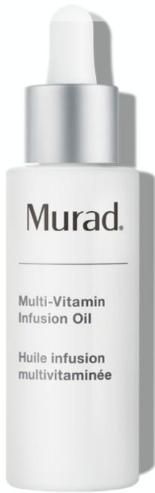
Multi Vitamin Infusion Murad